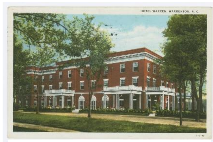
Hotel Warren Postcard from 1932

World War I and finances saw this process continue until April of 1920 when ground was finally broken and the excavation began...BUT...then work was stopped and the hotel boarded up until October 1, 1921 in September of that year. Why work was stopped isn't explained in the newspaper article, but they do note that this delay saved $15,000 in construction costs...so it seems to have been a good move.