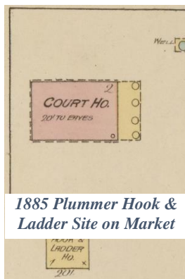
1885 Plummer Hook & Ladder Site on Market