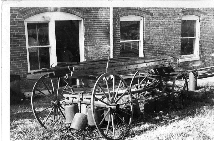
Original Ransom Bucket Wagon currently in the NC Museum of History, Raleigh. Note the ladders and hooks (firemen's pikes) on top & the oil cans to carry water to fight the fires.